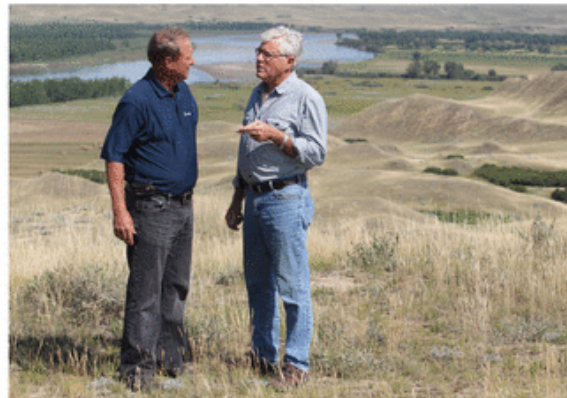
TransCanada Code of Business Ethics

You must also ensure that you use only legitimate means (such as searches of public information) to obtain competitive intelligence. You must never use deceit or misrepresent yourself to obtain such information, and you should never take advantage of information you receive in error (for example, e-mails, faxes or documents someone sent you in error, or documents left in a meeting room or in a public place).