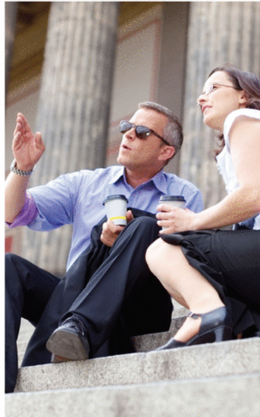
TransCanada Code of Business Ethics

ANSWER: Since TransCanada has an existing business relationship with the supplier and is not currently involved in any renewal or other negotiations and since the event is an annual (i.e. infrequent) business-related event, attended by many customers as well as supplier representatives, it is all right for you to attend, with your leader's approval. However, since the value of the event is significant, the supplier's payment for flights and accommodation could create a perception of conflict and/or an obligation on the part of TransCanada. Furthermore, TransCanada would not be in a position to reciprocate. So, the flights and accommodation should be paid for by TransCanada. You may accept the meals provided by the supplier as part of the event.