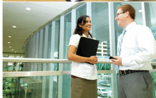
TransCanada Code of Business Ethics