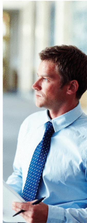
TransCanada Code of Business Ethics

In addition you must ensure that any legitimate expenditures, including their nature and purpose, are accurately reported, so that there is no question whether they were made for an improper purpose.