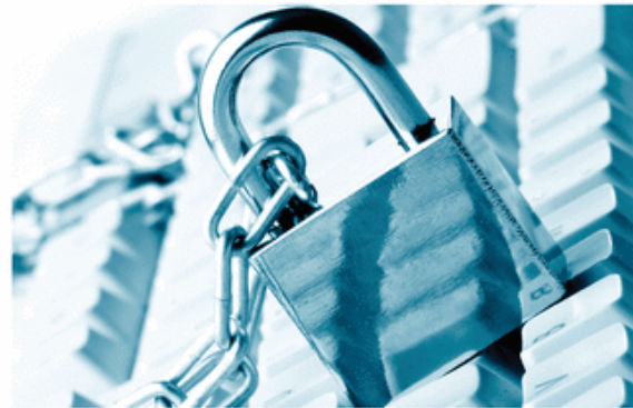
TransCanada Code of Business Ethics

For more information see the Information Management and Information Security Policies .