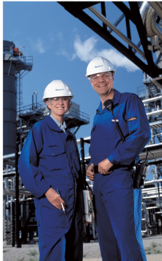
TransCanada Code of Business Ethics

ANSWER: You should never compromise your or anyone else's safety. If someone is pressuring you to do so, you should report the issue.