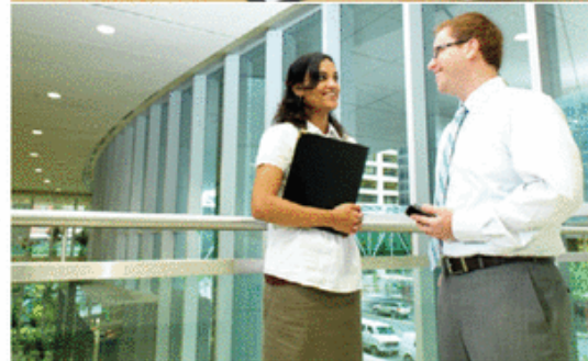
TransCanada Code of Business Ethics