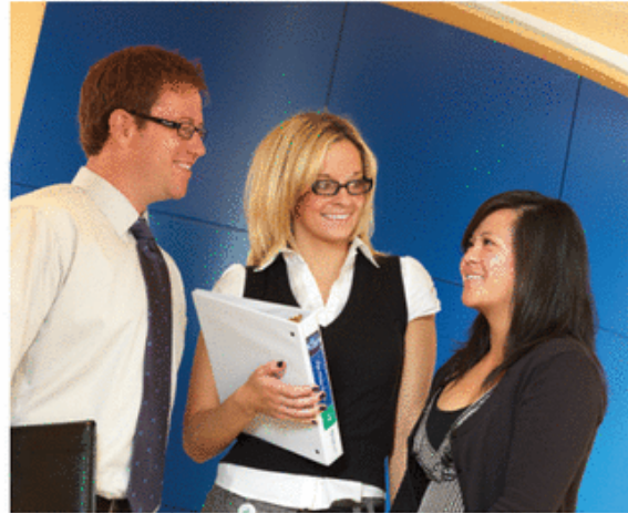
TransCanada Code of Business Ethics

ANSWER: If your investment in the supplier is through a mutual fund, it is unlikely that you would own more than 1% of the stock of the supplier. Because of the indirect nature of the investment, it is also less of a concern than if you owned the shares directly. Your ownership of mutual fund units is not a problem.