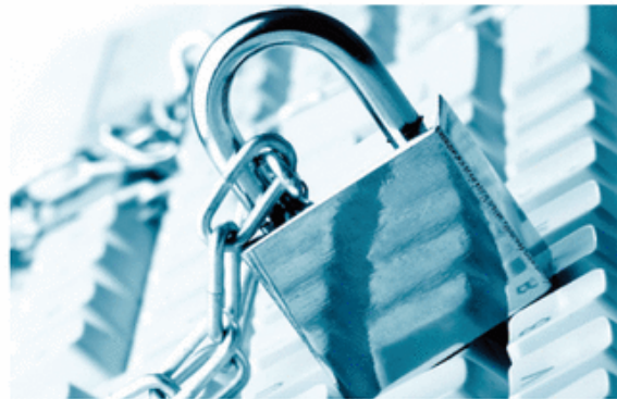
TransCanada Code of Business Ethics

For more information see the Information Management and Information Security Policies .