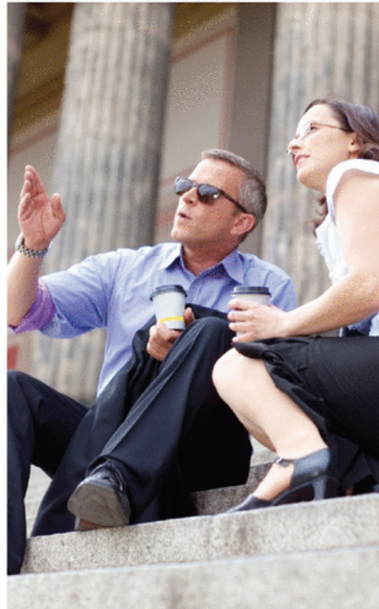
TransCanada Code of Business Ethics

ANSWER: Since TransCanada has an existing business relationship with the supplier and is not currently involved in any renewal or other negotiations and since the event is an annual (i.e. infrequent) business-related event, attended by many customers as well as supplier representatives, it is all right for you to attend, with your leader's approval. However, since the value of the event is significant, the supplier's payment for flights and accommodation could create a perception of conflict and/or an obligation on the part of TransCanada. Furthermore, TransCanada would not be in a position to reciprocate. So, the flights and accommodation should be paid for by TransCanada. You may accept the meals provided by the supplier as part of the event.