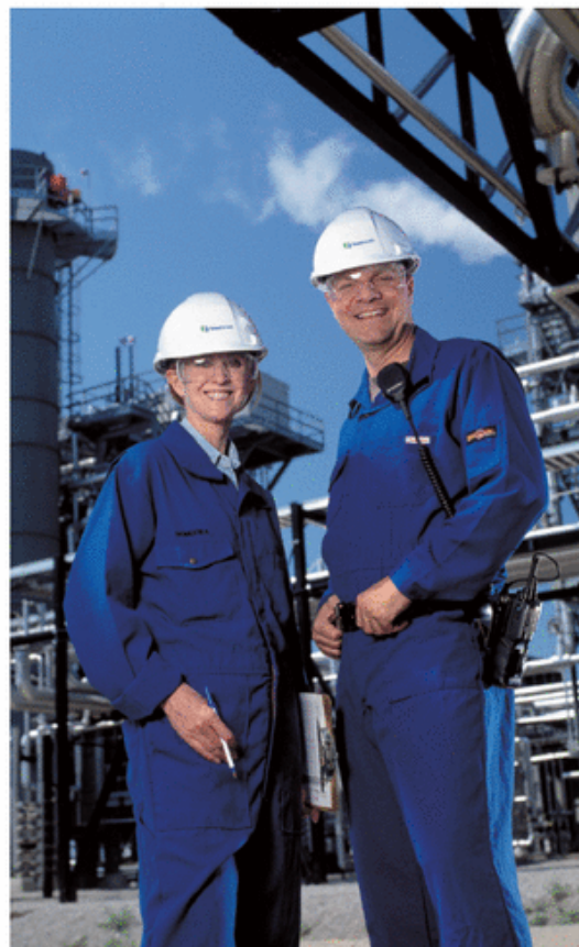
TransCanada Code of Business Ethics

ANSWER: You should never compromise your or anyone else's safety. If someone is pressuring you to do so, you should report the issue.