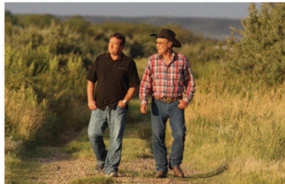
TransCanada Code of Business Ethics

You must also ensure that you use only legitimate means (such as searches of public information) to obtain competitive intelligence. You must never use deceit or misrepresent yourself to obtain such information, and you should never take advantage of information you receive in error (for example, e-mails, faxes or documents someone sent you in error, or documents left in a meeting room or in a public place).