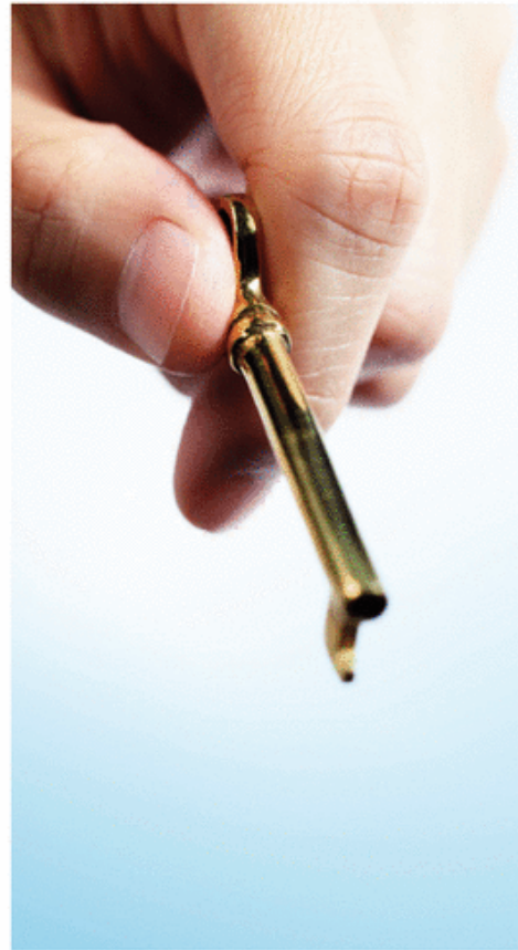
TransCanada Code of Business Ethics

It is also important to protect the security of TransCanada's information assets. You must comply with all internal policies and procedures concerning information security. Additional information can be found in TransCanada's Corporate and Information Security Policies .