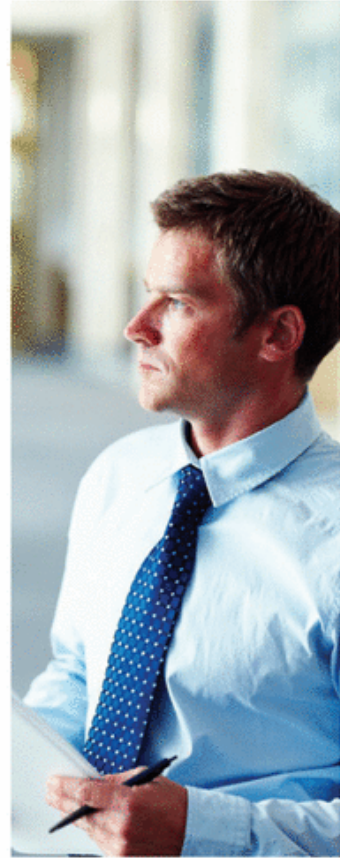
TransCanada Code of Business Ethics

Particular care must be taken to comply with the laws prohibiting bribery when working in jurisdictions such as Mexico, which is considered a high risk jurisdiction for corruption. Negotiations with First Nations officials can also be very sensitive. Payments made to First Nations must not be made to or for the benefit of any individuals, including the band chief, council members or negotiators, and should never be tied to First Nation permits, approvals or non-opposition to TransCanada projects.