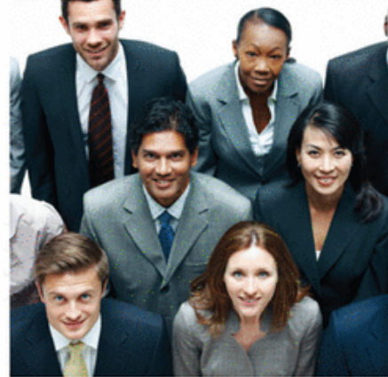
TransCanada Code of Business Ethics